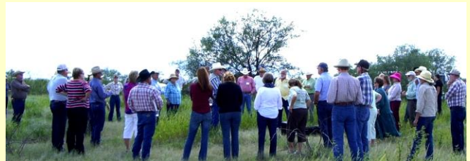
AZ NRCD Summer Conference 2013 Hayhurst Ranch